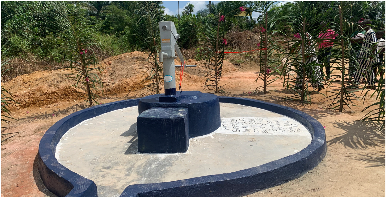
Second hand pump (well) provided to the community of Woryan (Wence) Town, Kakata, Liberia, West Africa. This well provides clean, potable water in close proximity to the new elementary school.

A s we emerged from a period of relative quiet imposed by the global pandemic, KUTOA AFRIKA FOUNDATION found new opportunities for impacting communities in crises, and attracted new partners to collaborate with, in providing solutions to those communities.